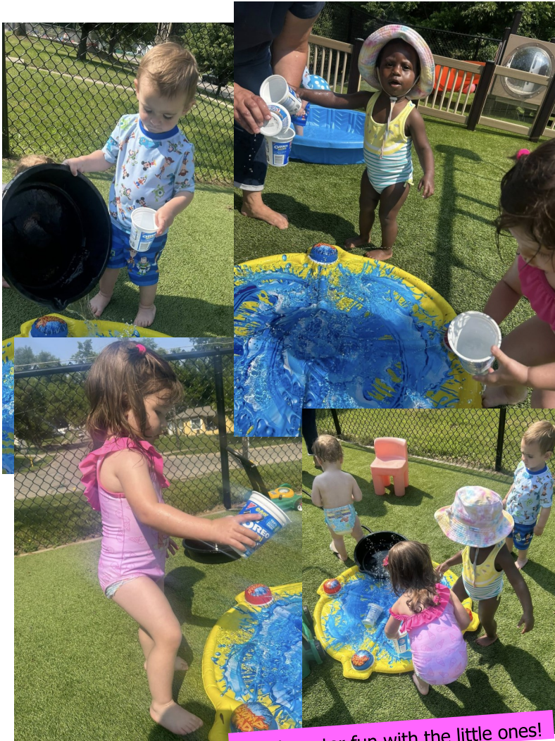
A little water fun with the little ones!

Office hours may vary, please call us at 517-629-8379 to make sure we're open before you come in. Thank you!